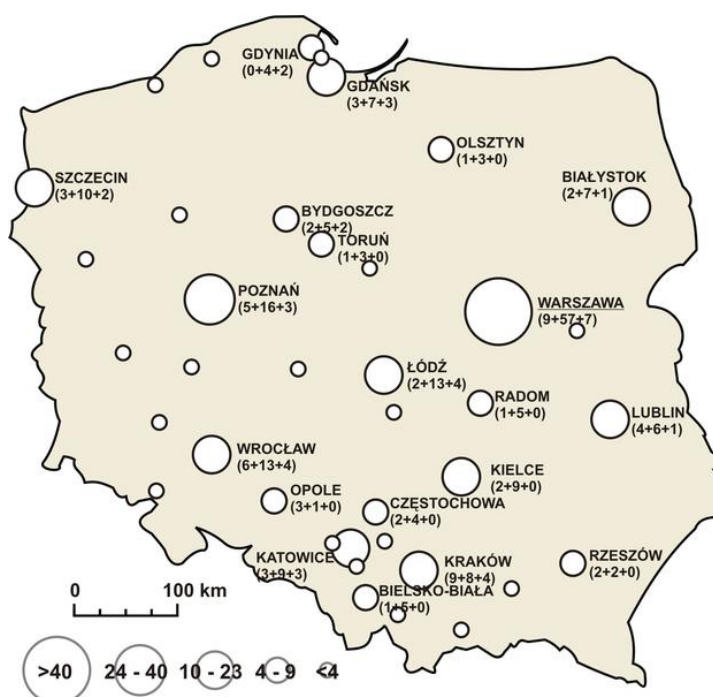
Picture 1 The map is presenting an aggregate distribution of institutions of higher education in Poland (as of 2005): the number of public institutions of higher education subordinate to the Ministry of Science and Higher Education + the number of non-public institutions + the number of public institutions which not accountable to the Ministry of Science and Higher Education. The picture does not include branches of universities http://pl.wikipedia.org/wiki/Szko%C5%82a_wy%C5%BCsza (data obtained on December 4 th 2011.)

Spatial distribution of institutions of higher education in Poland.